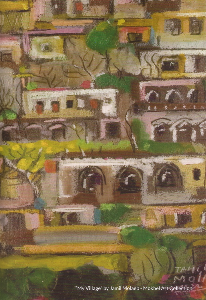
"My Village" by Jamil Molaeb - Mokbel Art Collection